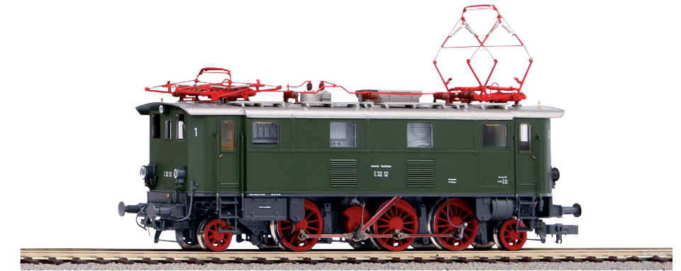
51410 Electric locomotive BR E 32 DB III

The now extensive family of old-style electric locomotives from PIKO is getting another addition. The latest classic of electric traction from PIKO impresses with its outstanding design. The metal inclined rod drive is faithfully reproduced. Spoked wheels further enhance the visual appearance and bring back memories of bygone days on the rails. Painting and printing are on a high PIKO level down to the smallest detail. The locomotive is completed by a flawless roof. The finest rivets contribute to this just as much as prototypical roof lines, completed by filigree metal pantographs.