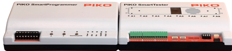
56415 PIKO SmartProgrammer